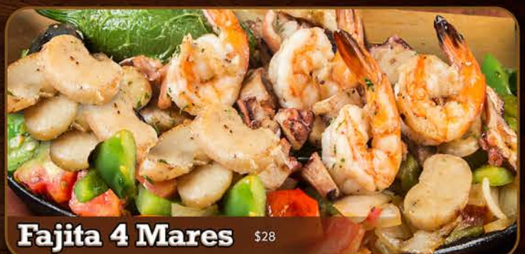
Fajita 4 Mares $28

• Frito • Mojo de Ajo • Diabla • Habanero