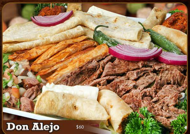
Don Alejo $60