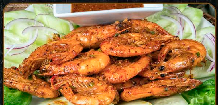
Camarones Tatemados $26