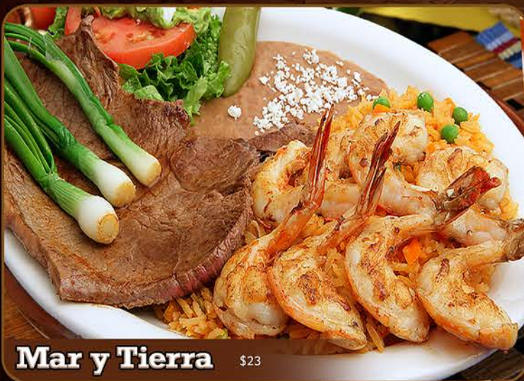
Mar y Tierra $23

Choice of Shrimp • Plancha • Mojo de Ajo • Empanizado • Diabla • Costa Azul