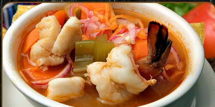
Consome Presidential $10