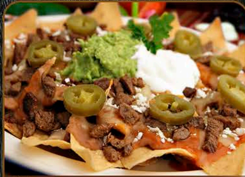
Nachos $14 • Asada • Pollo a la Plancha • Carnitas