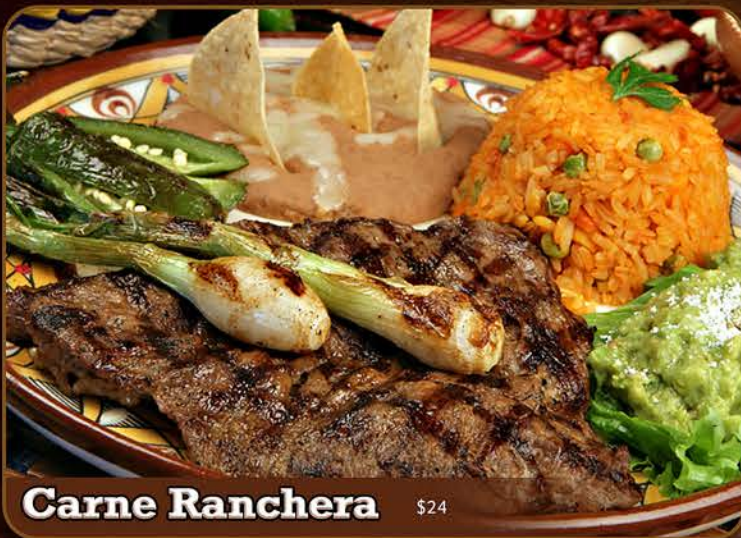
Carne Ranchera $24