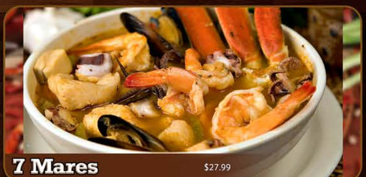
7 Mares $27.99