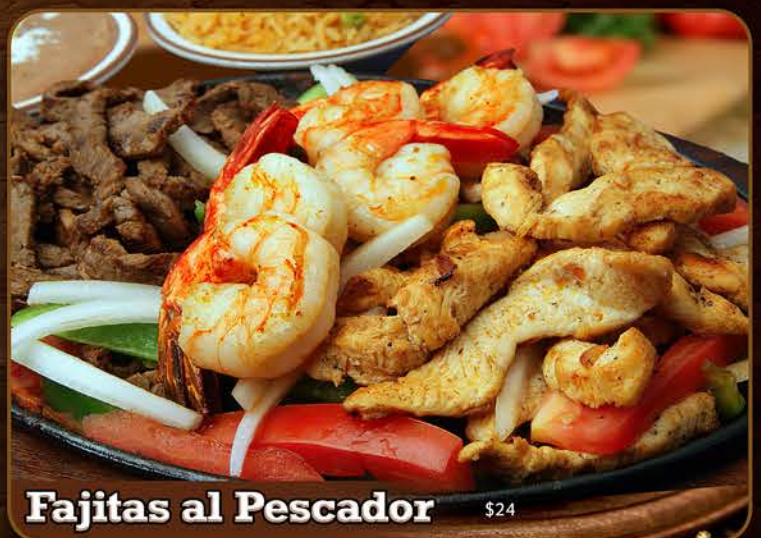
Fajitas al Pescador $24

Choice of Shrimp • Plancha • Mojo de Ajo • Empanizado • Diabla • Costa Azul