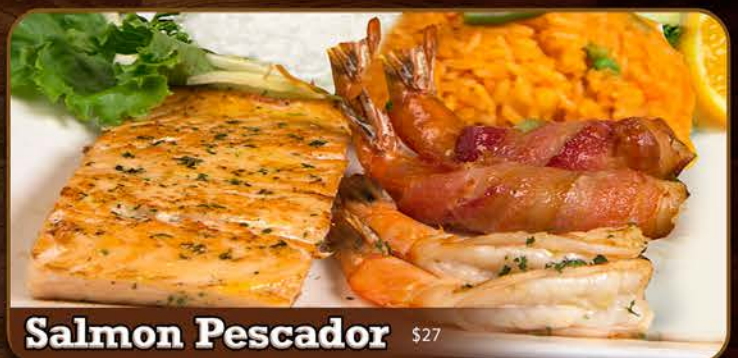
Salmon Pescador $27

• Plancha • Mojo de Ajo • Empanizado • Diabla • Costa Azul