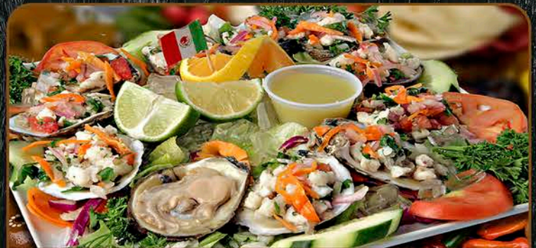
Oysters • PRESIDENCIAL (Half Dozen) $19 (Dozen) $29 • REGULAR (Half Dozen) $16 (Dozen) $27