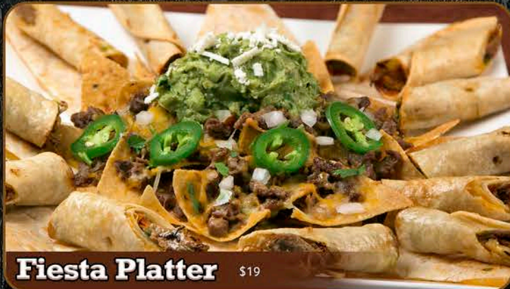
Fiesta Platter $19