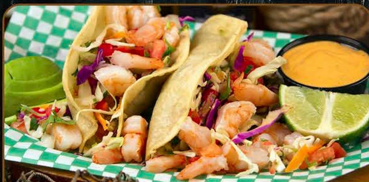
Tacos Dorados de Camaron $5 each