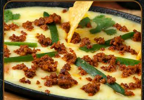
Queso Fundido $15