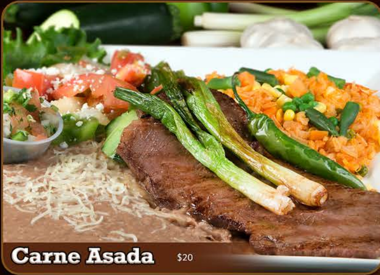
Carne Asada $20