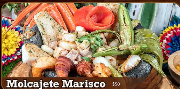
Molcajete Marisco $50