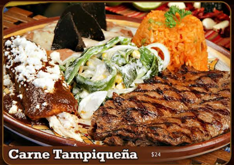
Carne Tampiqueña $24