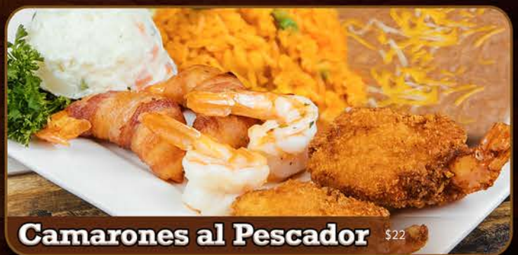
Camarones al Pescador $22

• Plancha • Mojo de Ajo • Empanizado • Diabla • Costa Azul