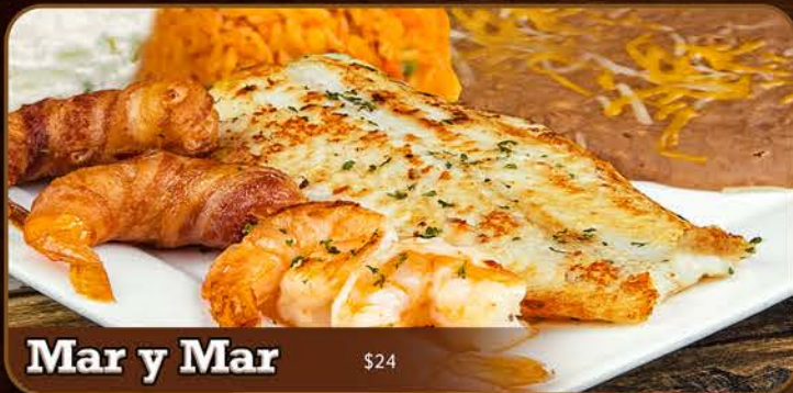
Mar y Mar $24

• Camaron • Campechana • Vuelve a la Vida