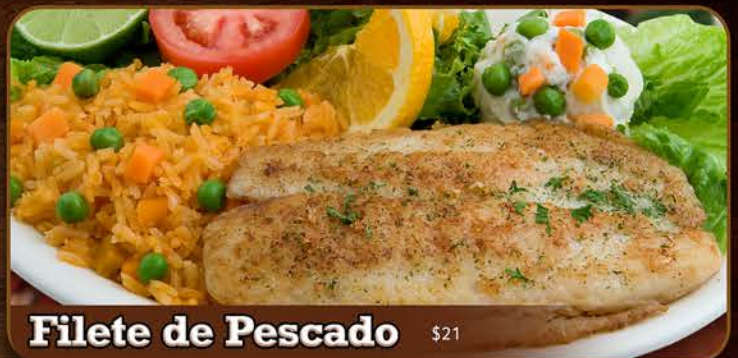
Filete de Pescado $21

• Plancha • Mojo de Ajo • Empanizado • Diabla • Costa Azul